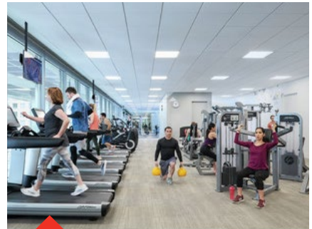
KINETIC® FITNESS CENTER