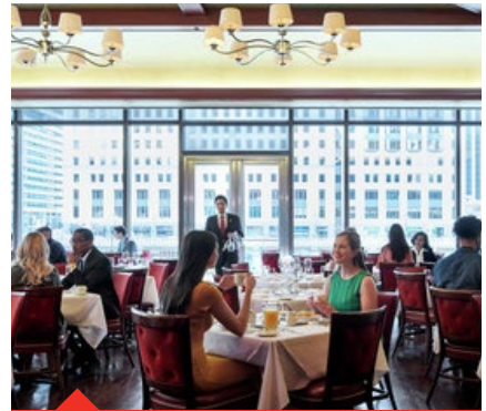
CHICAGO CUT STEAKHOUSE

Abundant on-site amenities and workday conveniences add balance and productivity to your workday.