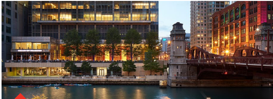
EXCLUSIVE RIVERFRONT ACCESS