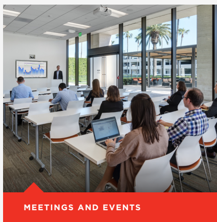
MEETINGS AND EVENTS