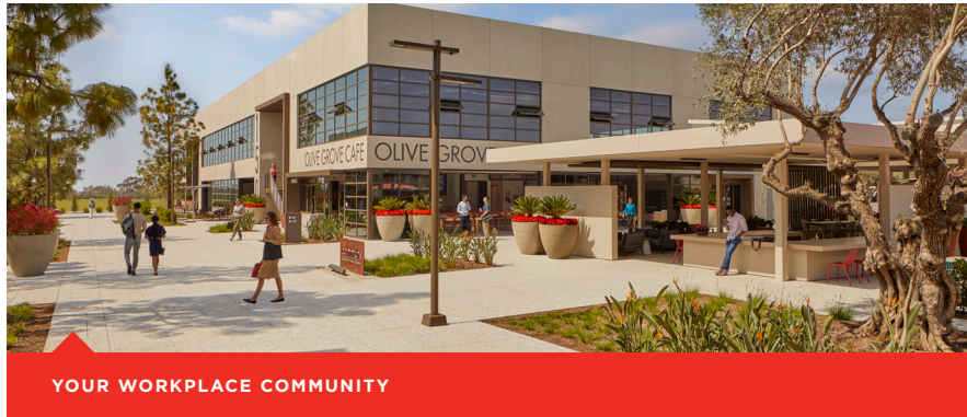
YOUR WORKPLACE COMMUNITY

This creative, open-air office village delivers distinctive amenities along a central pedestrian pathline with indoor/outdoor connections.