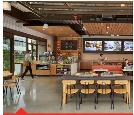
OLIVE GROVE CAFE