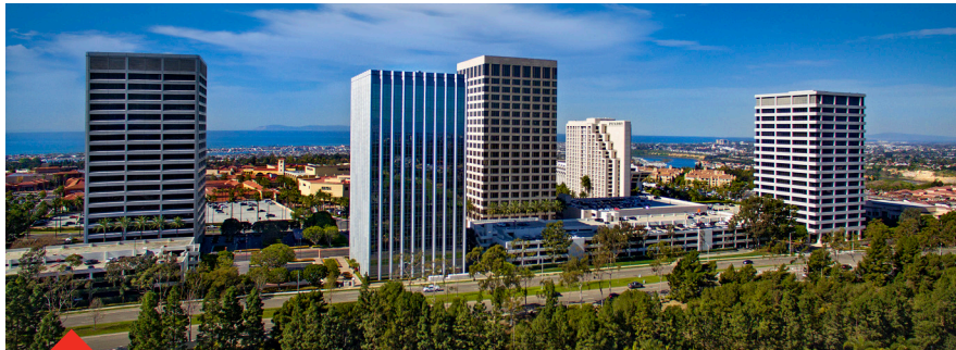
YOUR WORKPLACE COMMUNITY