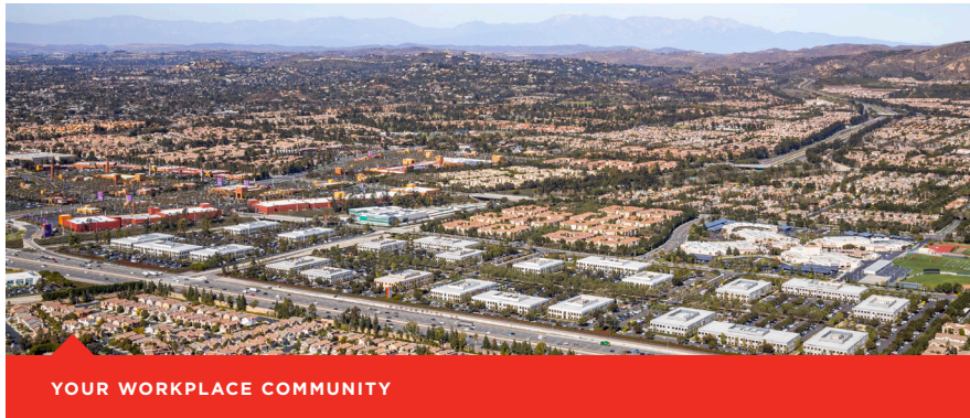
YOUR WORKPLACE COMMUNITY

Contemporary on-site conveniences and an unbeatable Del Mar Heights location make Township 14 the ultimate place to work.