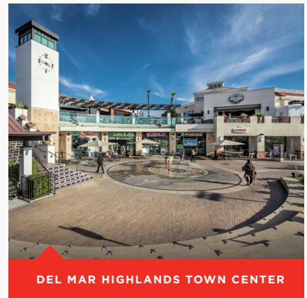
DEL MAR HIGHLANDS TOWN CENTER