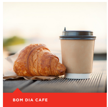
BOM DIA CAFE