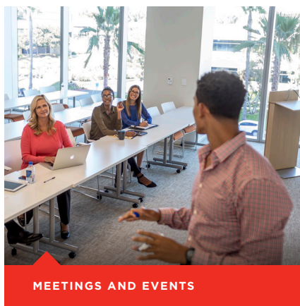
MEETINGS AND EVENTS