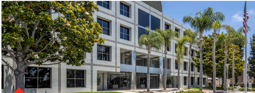
YOUR WORKPLACE COMMUNITY