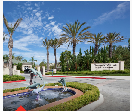
TORREY VILLAS APARTMENT HOMES