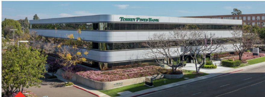
YOUR WORKPLACE COMMUNITY