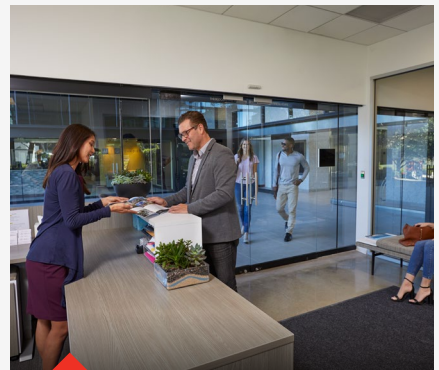
CUSTOMER RESOURCE CENTER