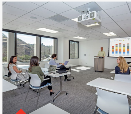
MEETINGS & EVENTS