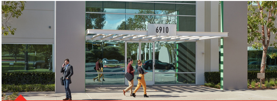
YOUR WORKPLACE COMMUNITY