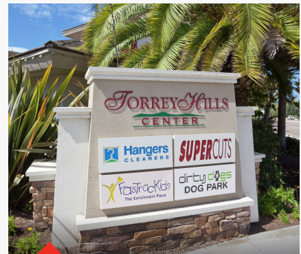
TORREY HILLS CENTER