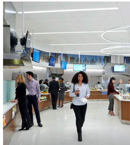
CAFÉ AT THE EXCHANGE