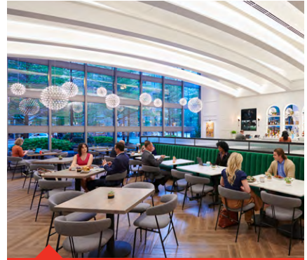
KINSLEY BY FAIRGROUNDS

Abundant on-site amenities and workday conveniences add balance and productivity to your workday.