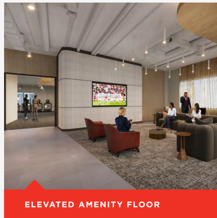
ELEVATED AMENITY FLOOR