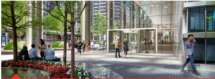
YOUR WORKPLACE COMMUNITY