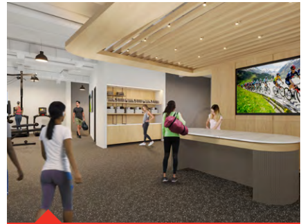
KINETIC ® FITNESS CENTER