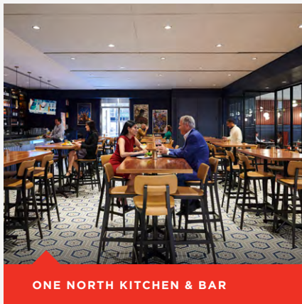
ONE NORTH KITCHEN & BAR