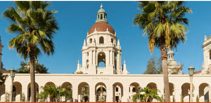
PASADENA CITY HALL