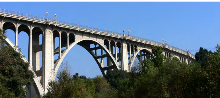
COLORADO STREET BRIDGE