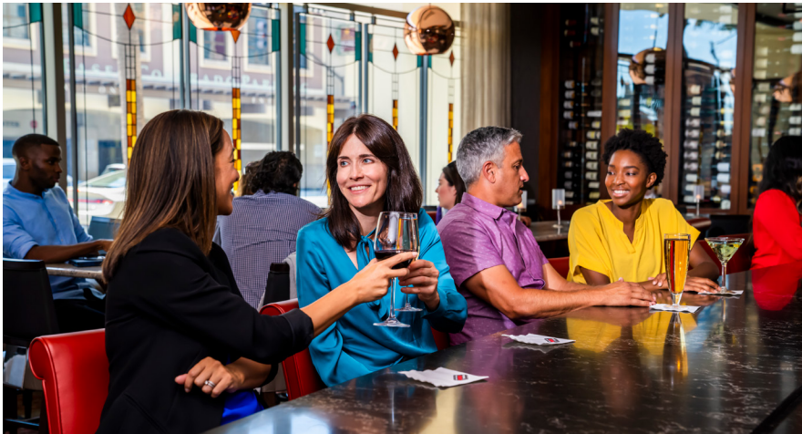
RUTH'S CHRIS STEAK HOUSE