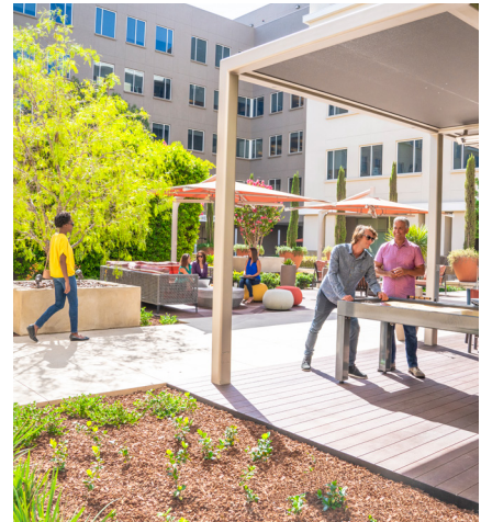
OUTDOOR WORKSPACE & LOUNGE