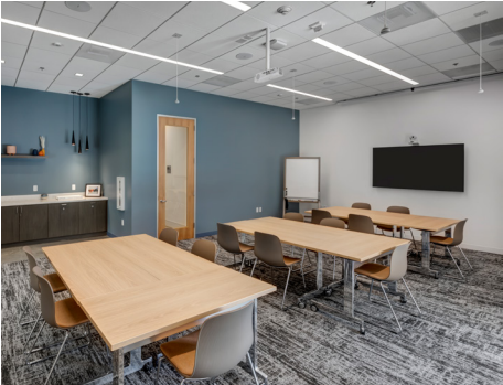
VENUE MEETINGS & EVENTS