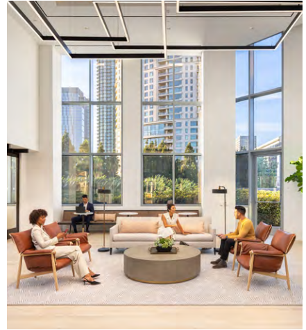
VENUE MEETINGS & EVENTS