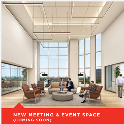
NEW MEETING & EVENT SPACE (COMING SOON)