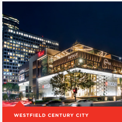
WESTFIELD CENTURY CITY