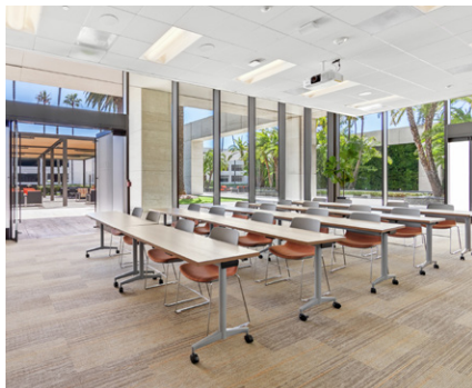
VENUE MEETINGS & EVENTS