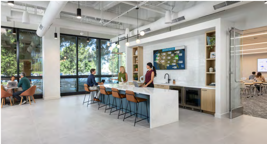
VENUE MEETINGS & EVENTS