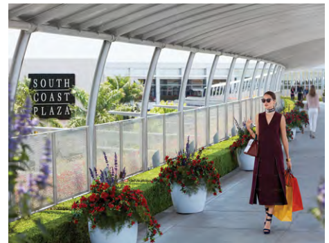
SOUTH COAST PLAZA