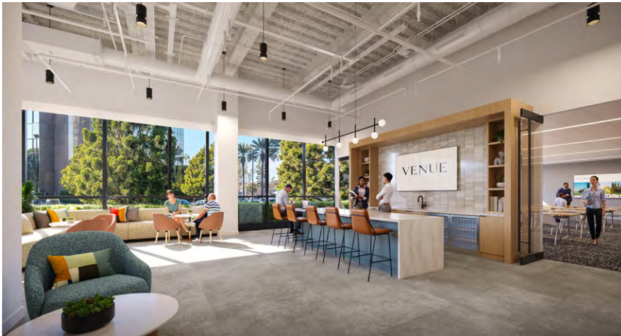
VENUE MEETINGS & EVENTS