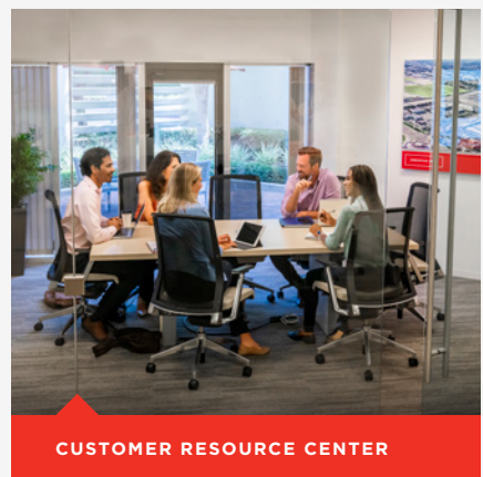
CUSTOMER RESOURCE CENTER