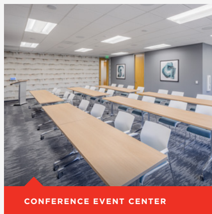
CONFERENCE EVENT CENTER