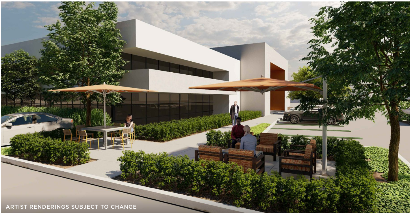
ARTIST RENDERINGS SUBJECT TO CHANGE

Experience 3 Morgan , an ideal choice for office, R&D, production and warehouse. Offers abundant surface parking, building top signage, and convenient access to dining and retail amenities. Arriving Late 2024: enhanced outdoor workspace with shaded seating and new evergreen landscaping adjacent to the building entry.