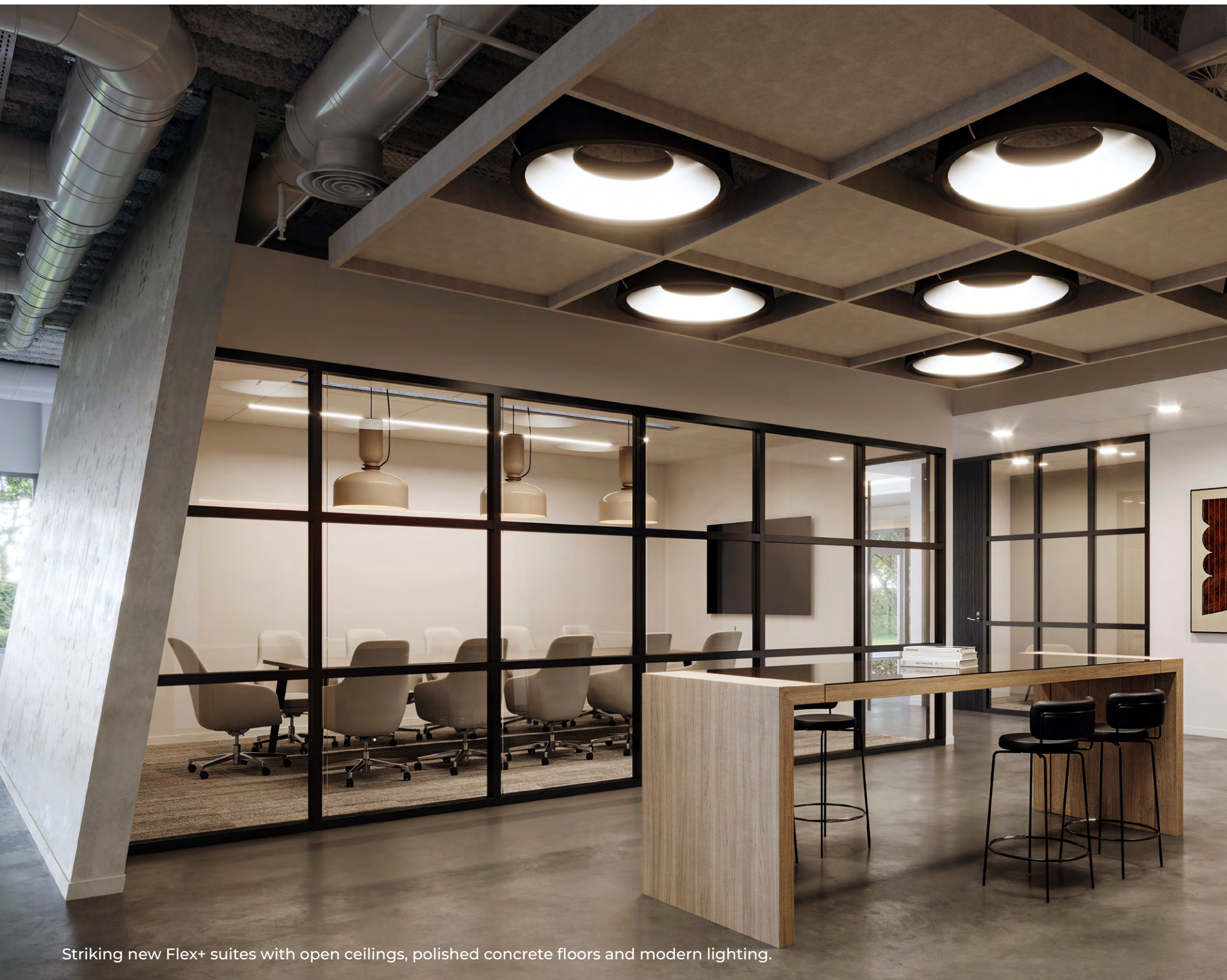
Striking new Flex+ suites with open ceilings, polished concrete floors and modern lighting.