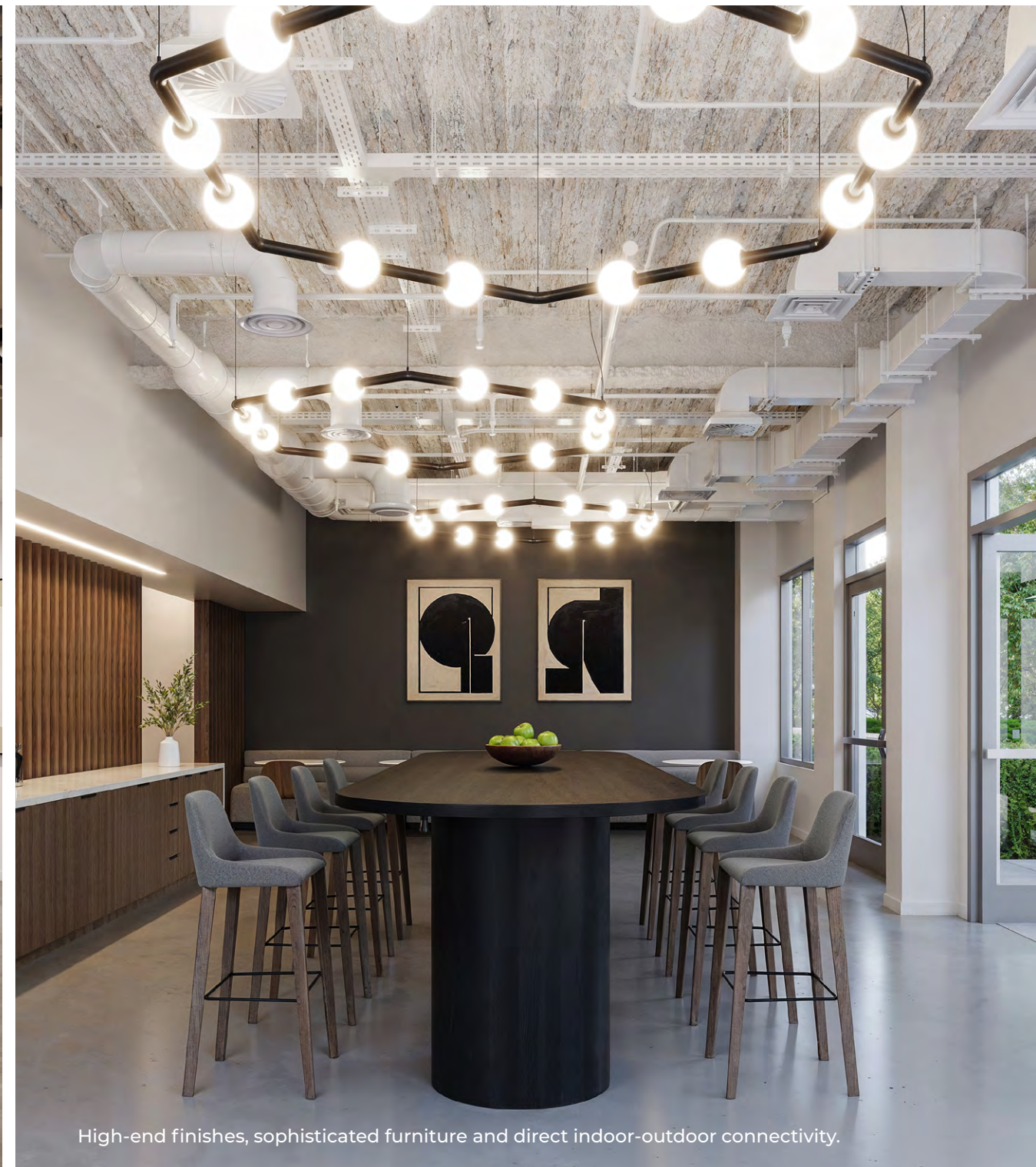
High-end finishes, sophisticated furniture and direct indoor-outdoor connectivity.