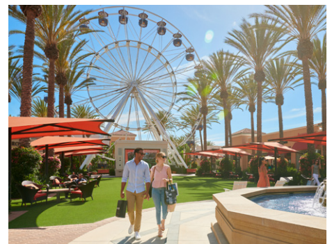
IRVINE SPECTRUM CENTER®