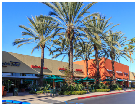
SAND CANYON PLAZA