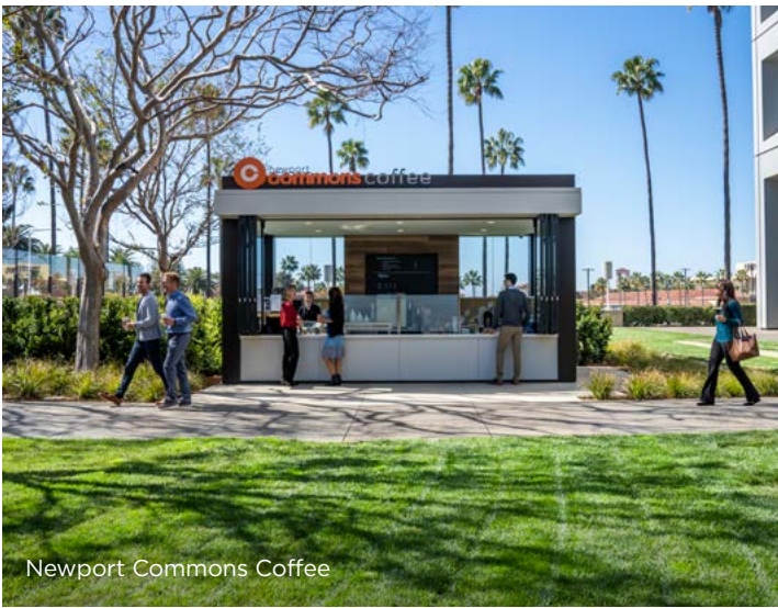
Newport Commons Coffee