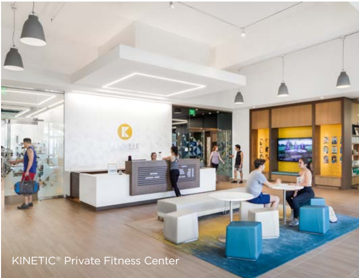
KINETIC® Private Fitness Center