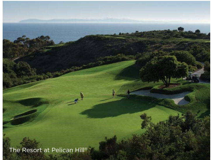
The Resort at Pelican Hill®