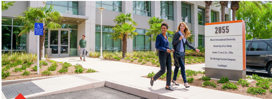
YOUR WORKPLACE COMMUNITY