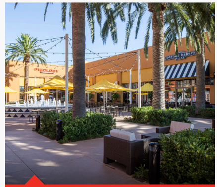
THE MARKET PLACE