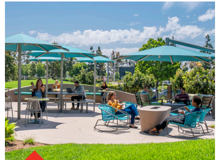
BBQ STATION & FIRE PIT