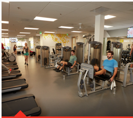
KINETIC® AT MARKET PLACE CENTER