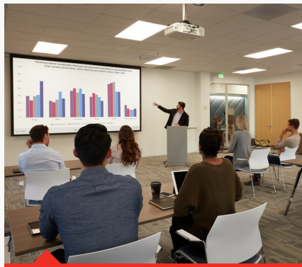
MEETINGS AND EVENTS