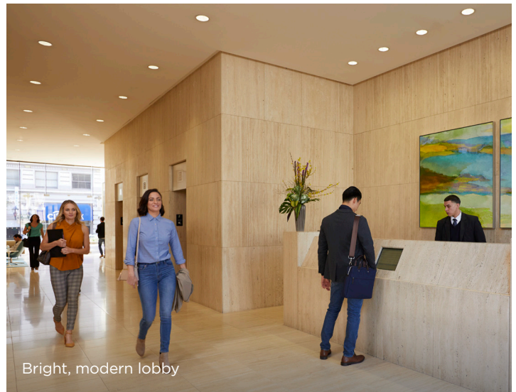
Bright, modern lobby