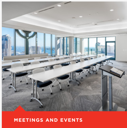
MEETINGS AND EVENTS