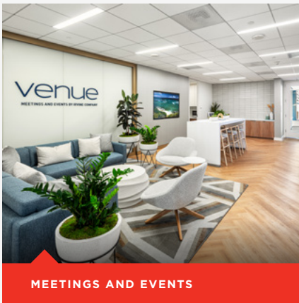
MEETINGS AND EVENTS