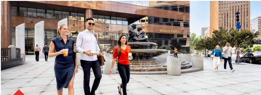
YOUR WORKPLACE COMMUNITY

The only Irvine Company downtown San Diego tower with exclusive outdoor workspace and adjacent dining options, it's convenient to take a refreshing break or collaborate under the sun at Wells Fargo Plaza.