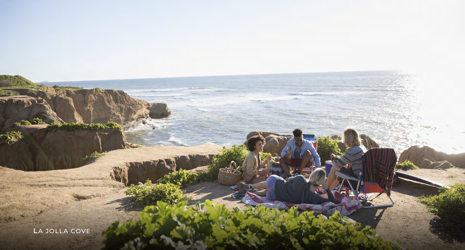
LA JOLLA COVE

"Ours is an ideal location for a growing technology company. It offers high-quality work environments, easy freeway access, outstanding amenities and proximity to the university and nearby technology."