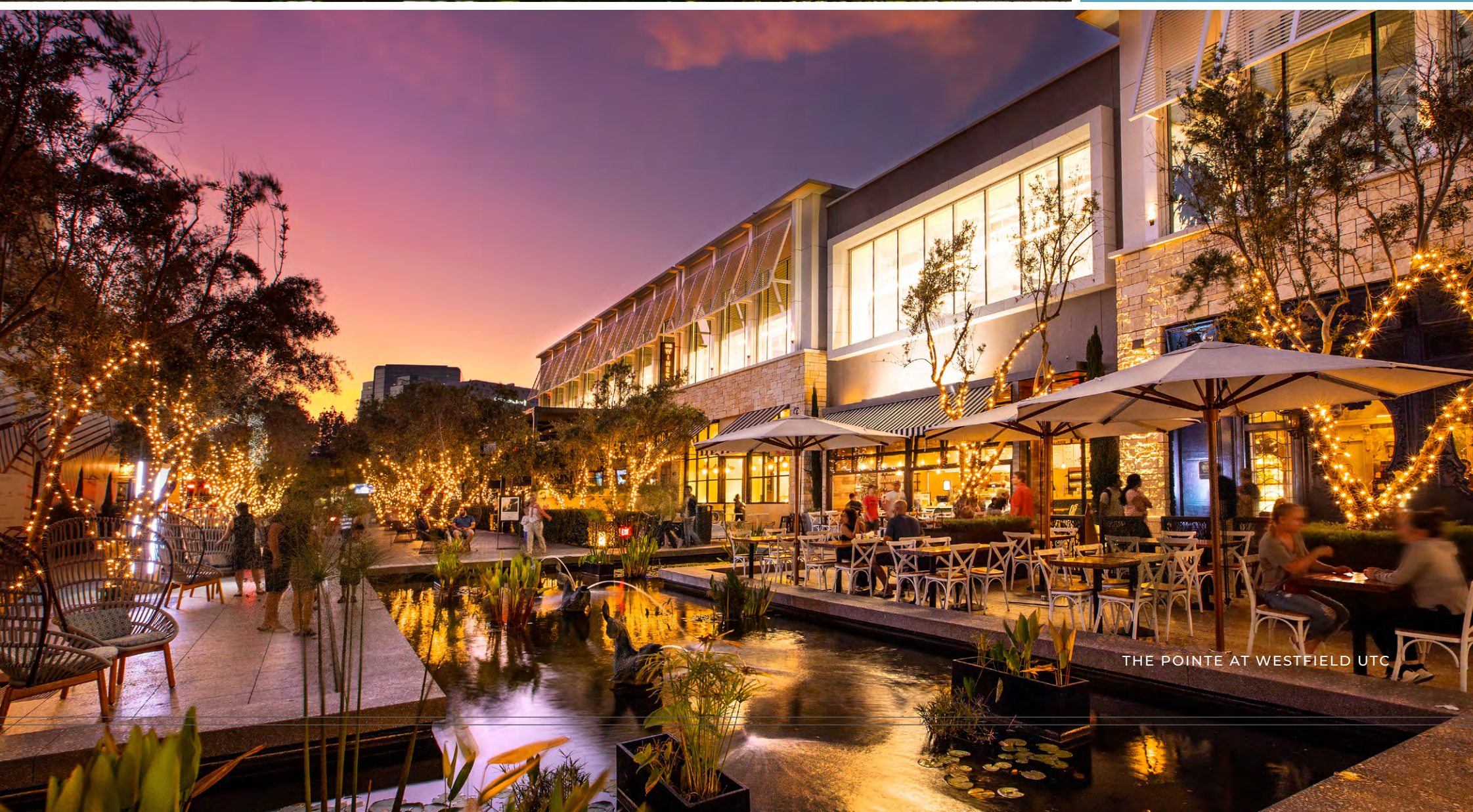
THE POINTE AT WESTFIELD UTC

Experience the dynamic energy of La Jolla UTC with Irvine Company, where the area's world-famous coastal lifestyle draws top talent from San Diego and beyond. Our workplaces are conveniently located near everything your teams need to thrive, including La Jolla UTC's best restaurants, shops and residential communities.