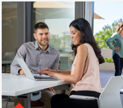
MEETINGS & EVENTS