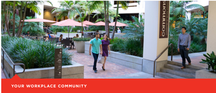
YOUR WORKPLACE COMMUNITY