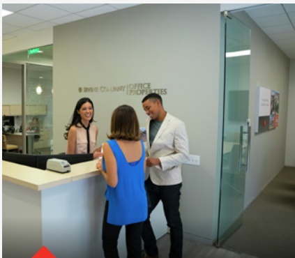
CUSTOMER RESOURCE CENTER