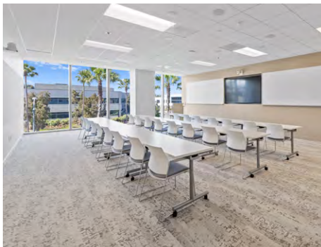
VENUE MEETINGS & EVENTS