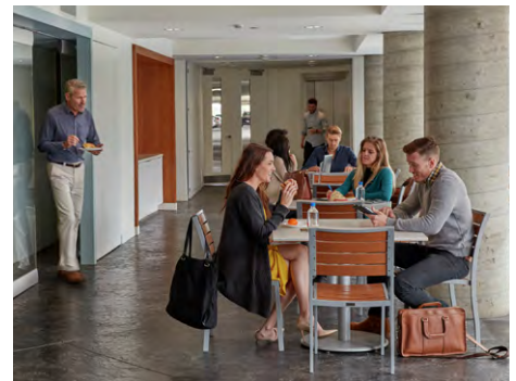
BOM DIA CAFÉ