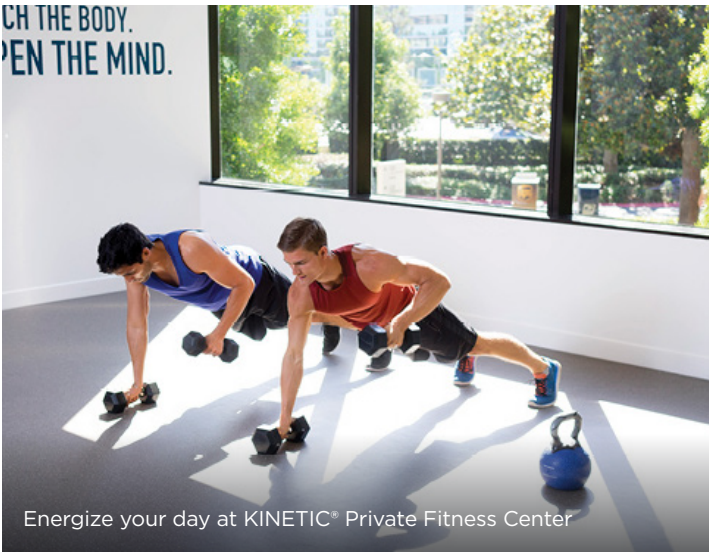
Energize your day at KINETIC® Private Fitness Center