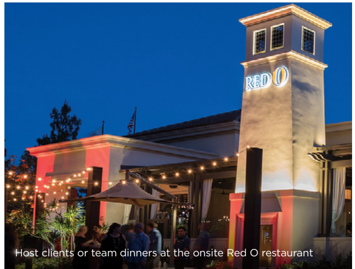
Host clients or team dinners at the onsite Red O restaurant