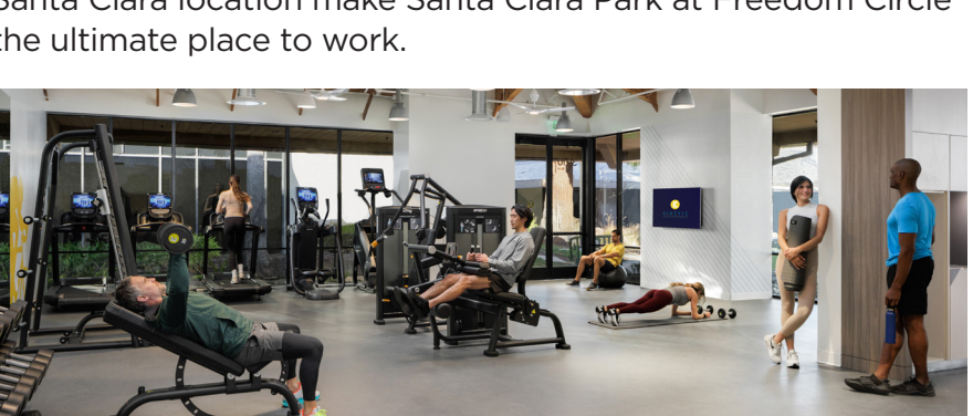
KINETIC* PRIVATE FITNESS CENTER

Contemporary on-site conveniences and an unbeatable Santa Clara location make Santa Clara Park at Freedom Circle the ultimate place to work.