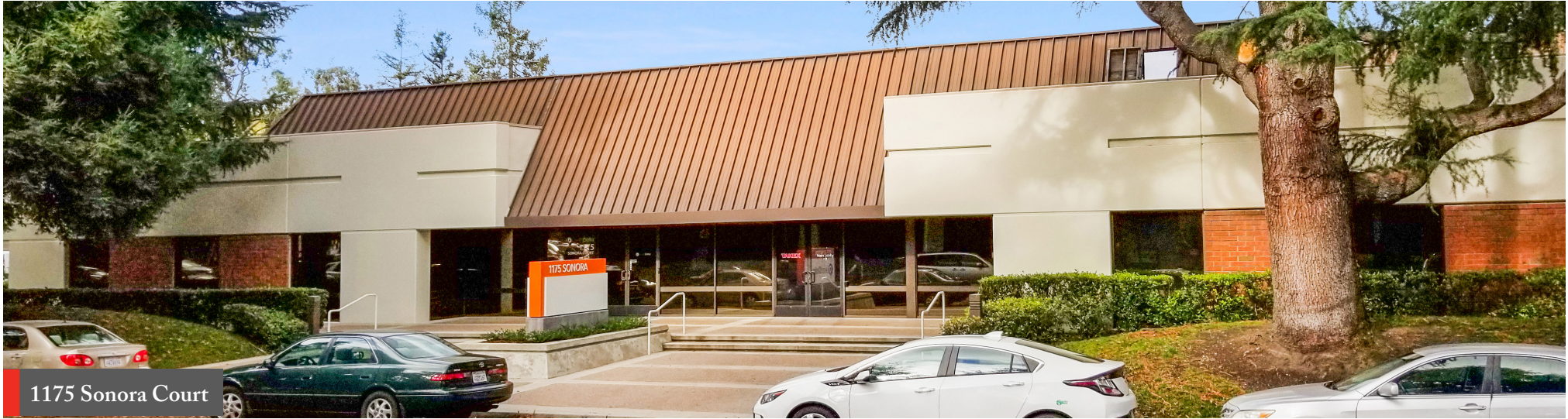
1175 Sonora Court