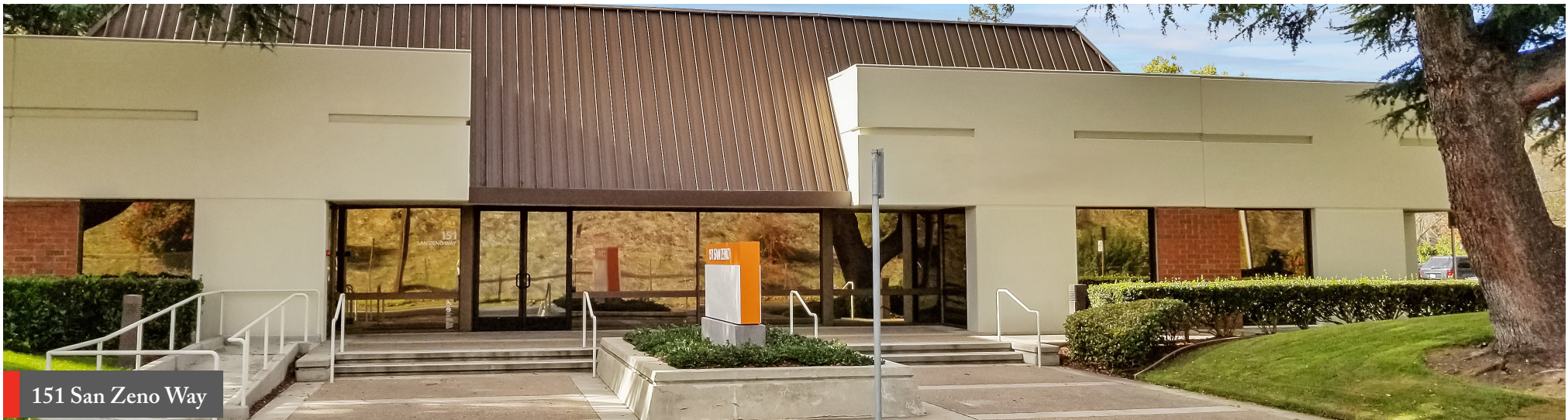
151 San Zeno Way