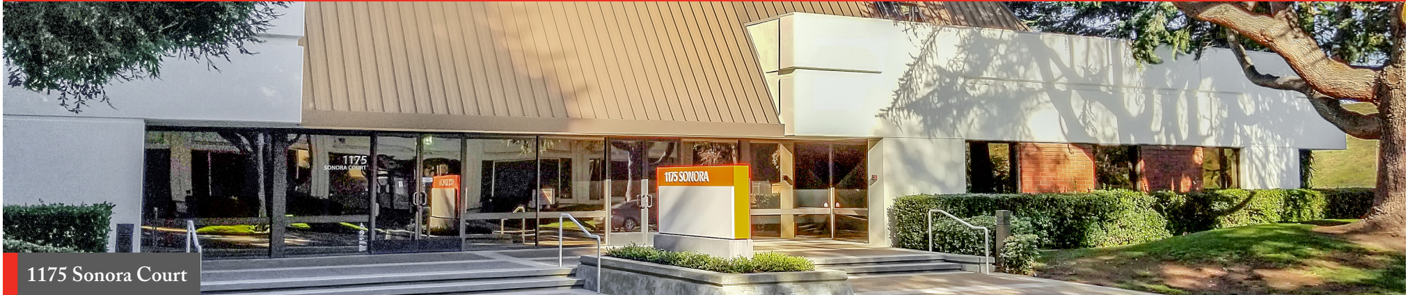
1175 Sonora Court