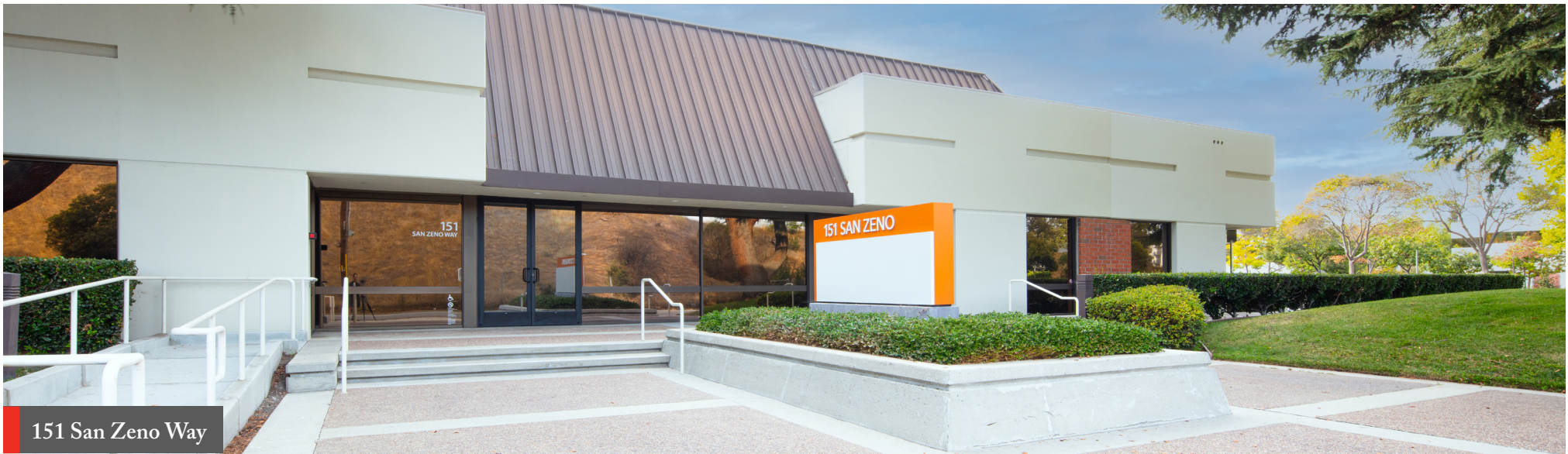
151 San Zeno Way